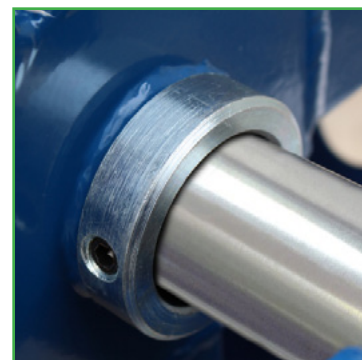
Standard 2 1/8" Locking Reel Collar