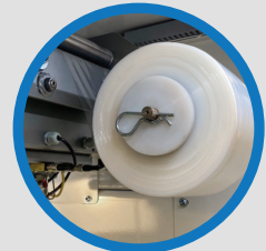
AUTOMATIC STRETCH WRAP

Reel Power Industrial designs and builds a wide range of material handling equipment for hose, tube, pipe, wire and cable industries – including coilers, haul-offs/caterpullers, payoffs, take-ups, accumulators, linear measurers, rewind/test lines, twinner/quadders, concentric and eccentric taping lines, spiral striping machines, control upgrades and many specialty items. Please visit us at reelpowerind.com to learn more.