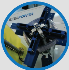
AUTOMATIC COILING HEADS