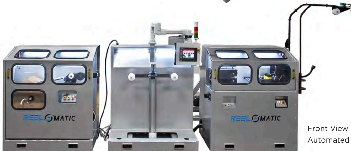
Front View of Fully Integrated Automated Machine