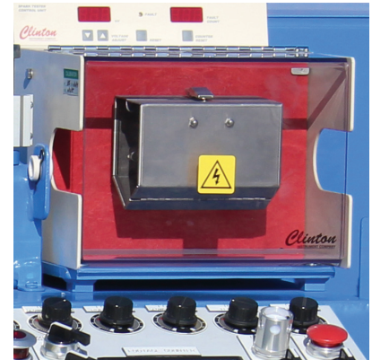
Clinton Spark Tester