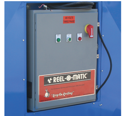
UL Certified Panel Shop