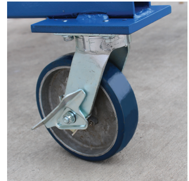
Optional 8" x 2" Polyurethane Wheels

40" diameter x 16" I.D. x 32" wide 5 compartments x 350 ft. 500 MCM per compartment