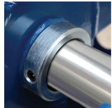
Standard 2 1/8" Locking Reel Collar