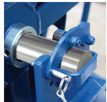
Standard Shaft Safety Locks