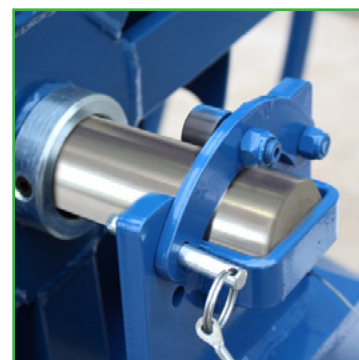
Standard Shaft Safety Locks