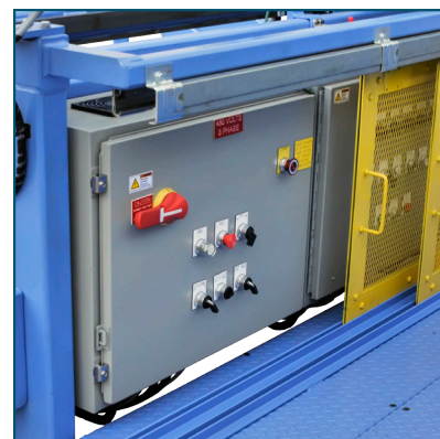
UL Approved Control Box