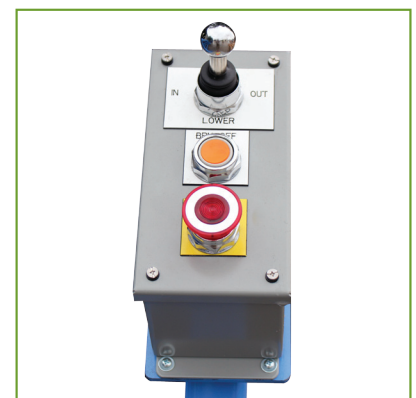
Front Mounted Control Station