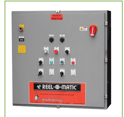
UL Panel Box