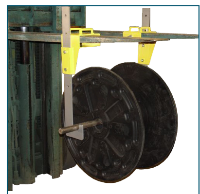
RL50 Reel Loader