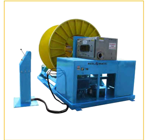
Model SP-CRS108 Powered Cable Reel Stand