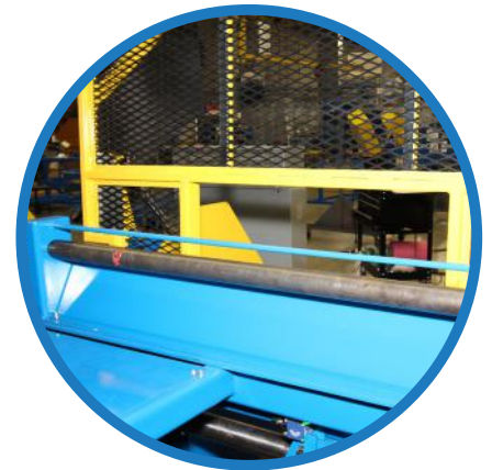
HARDENED GUIDE ROLLER