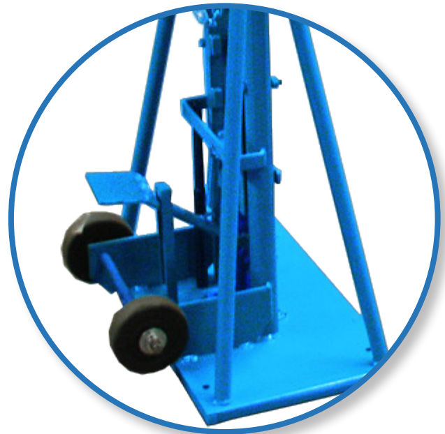
Foot-Operated Hydraulic Jack