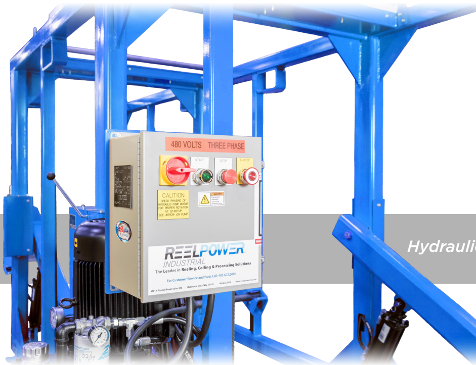
Hydraulic Lift with Control Panel