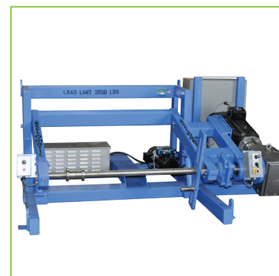
RST/TU - Shafted Take-Up