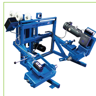
SP/RSP - Shaftless Pay-Off