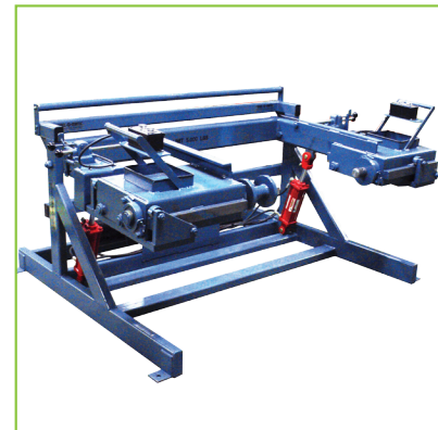
RSP5 - Shaftless Pay-Off