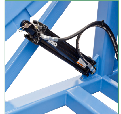
Powered Hydraulic Reel Lift