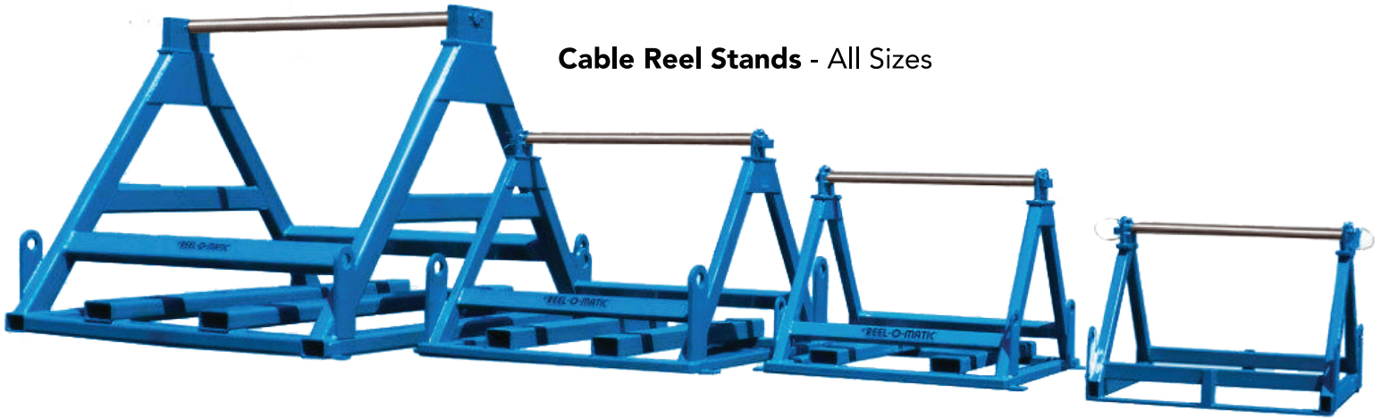
Cable Reel Stands - All Sizes

Standard Paralleling Reel Stands - Custom sizes are available.