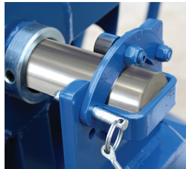
Standard Shaft Safety Locks

*Shown with 2" shafts 3" & 4" Arbor Bushings are available.