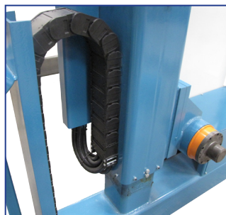
Protective Cable Tracks