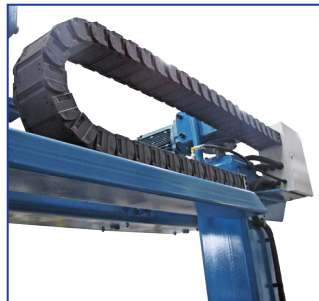
Protective Cable Tracks