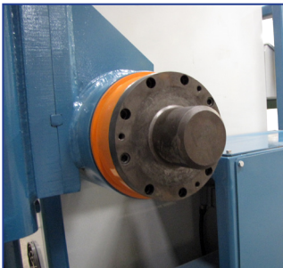
Hardened Arbor Adapters