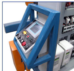
Guarded Control Panel