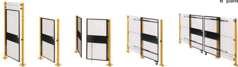
8' swing door | 6' swing door | Double swing door | Single sliding door | Double sliding door