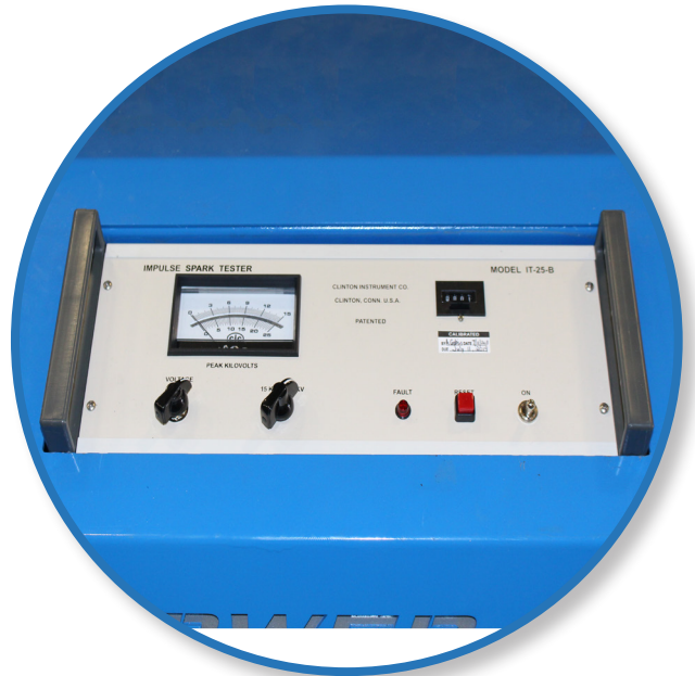
Integral Clinton Sparktesters