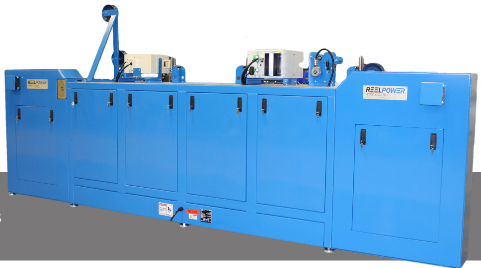
Easy Access Rear Panels