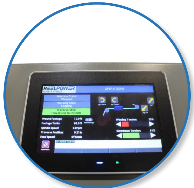
PLC/HMI Digital Controls